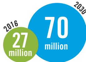
Number of Americans affected by osteoarthritis now and by 2030